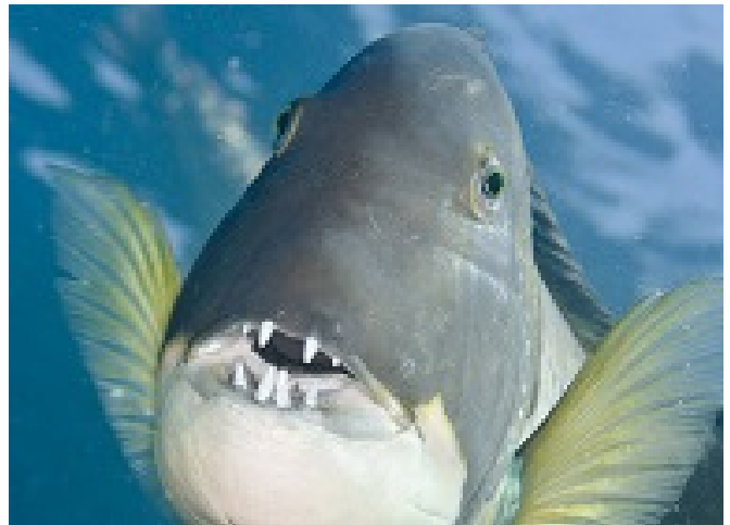
Above: Baldchin Grouper