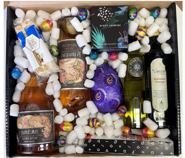
RIGHT: Easter raffle prize